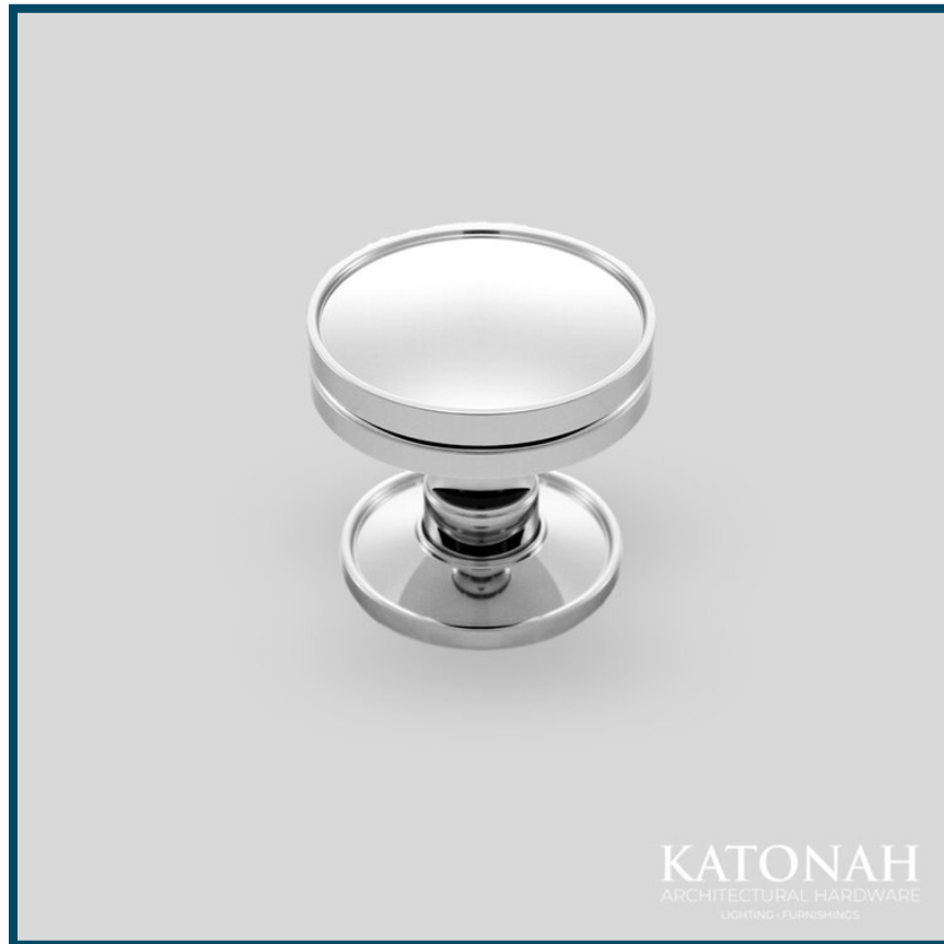
Carlyle Door Knob