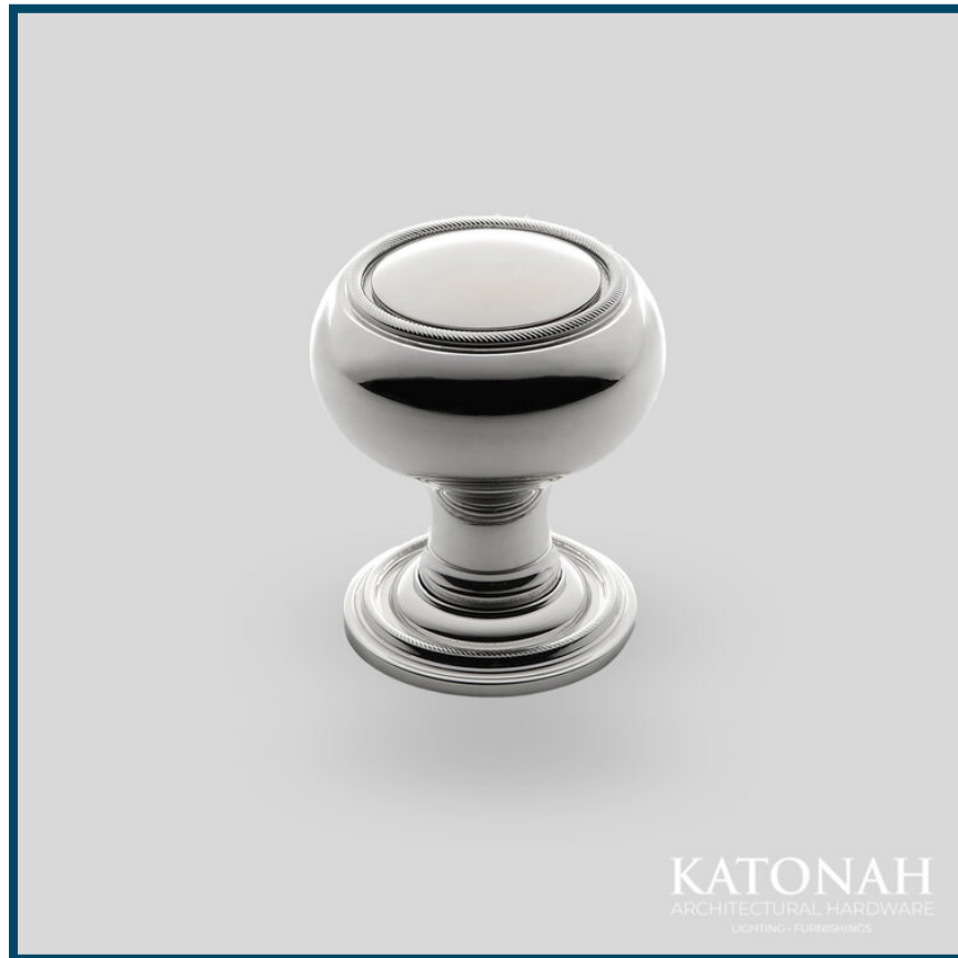
Doyle Door Knob