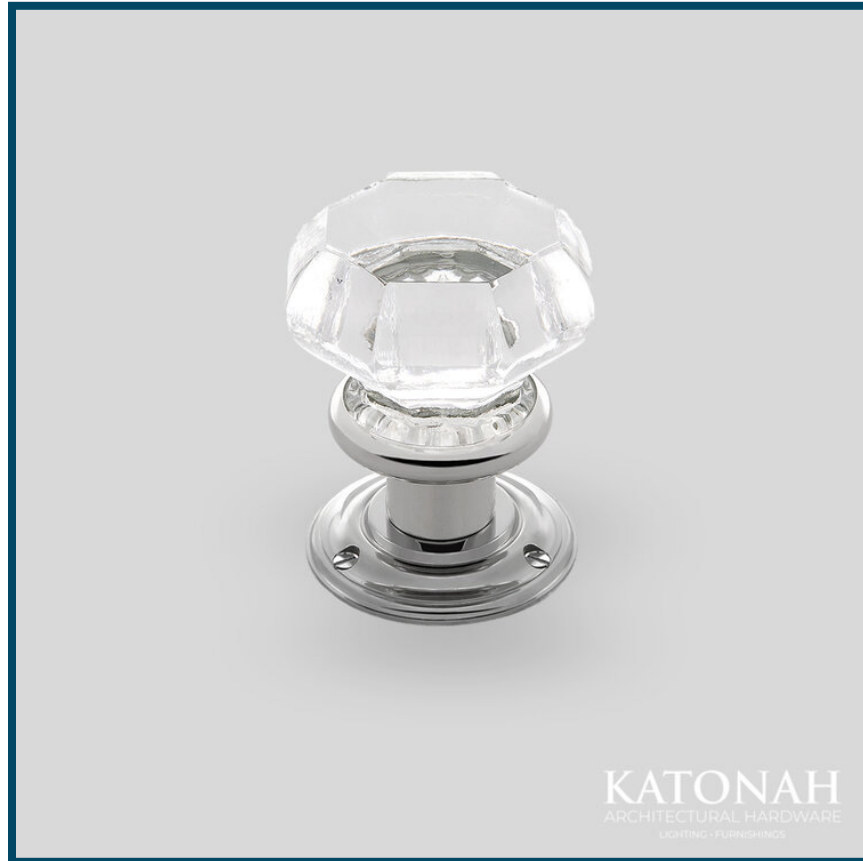
Shelton B Door Knob