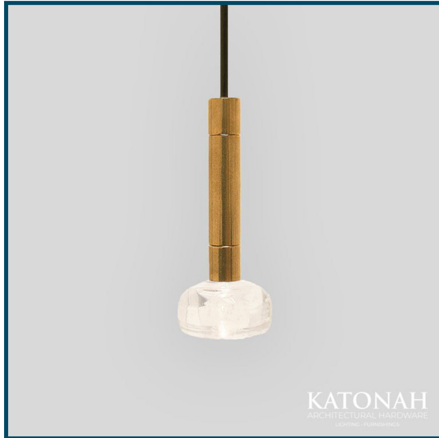
Torch Pendant - PE625

Available In: 2-1/2" W x 6-9/16" L Max Cord Length: 10'